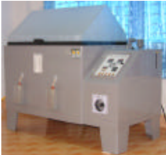
Salt Spray Test 999Hours