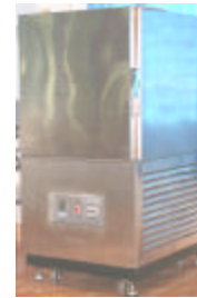
Temperature Chamber -10° to +100°C