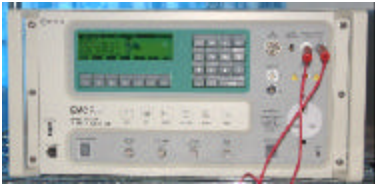
Surge Test 6kV 500A Surge 1.2x50X3000A