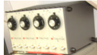
Tunable Band Pass Filter TRILITHIC VF-4