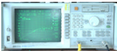
Network Analyzer HP8714C